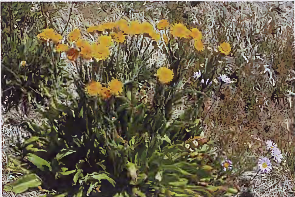
Figure 3. Podolepis robusta , Mt Nelse, Bagong High Plains, Victoria